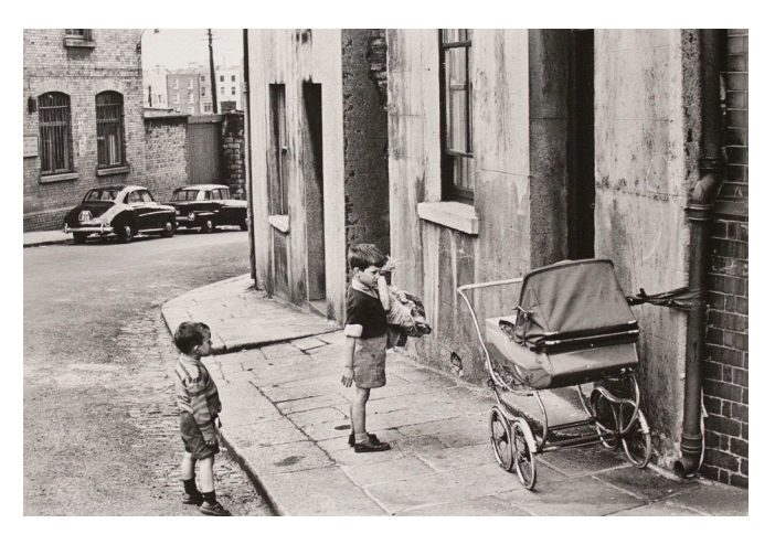
Alen MacWeeney, Irish-American (born 1939), Two Curious Boys, a Cabbage and a Pram, Dublin, 1963, archival pigment print, 13 x 19 in. Gift of Gregory Roselli, 2021.3.6

Munson-Williams diligently pursued MWP 2025 , the strategic five-year plan launched in 2019. The exhibitions Emma Amos: Color Odyssey and Call & Response: Collecting African American Art , celebrated works by African American artists. The exhibitions opened with a festive Juneteenth celebration featuring local performers, The Ladies of Soul and Their Gentlemen.